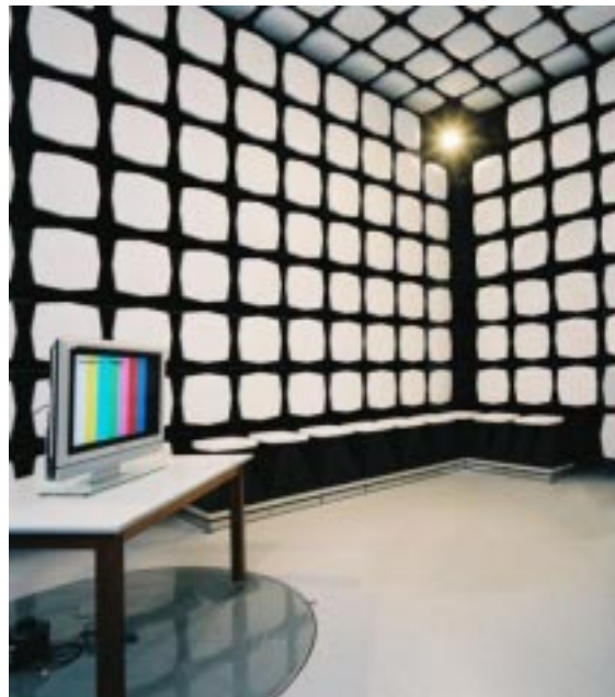
ETS-Lindgren FACT 3™ EMC Semi-Anechoic Chamber

ETS-Lindgren FACT 3™ Chambers offer semi-anechoic radiated emissions (RE) and fully anechoic radiated immunity (RI) compliance test capability for most international EMC compliance regulations.