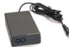
Carry case and AC power supply as standard