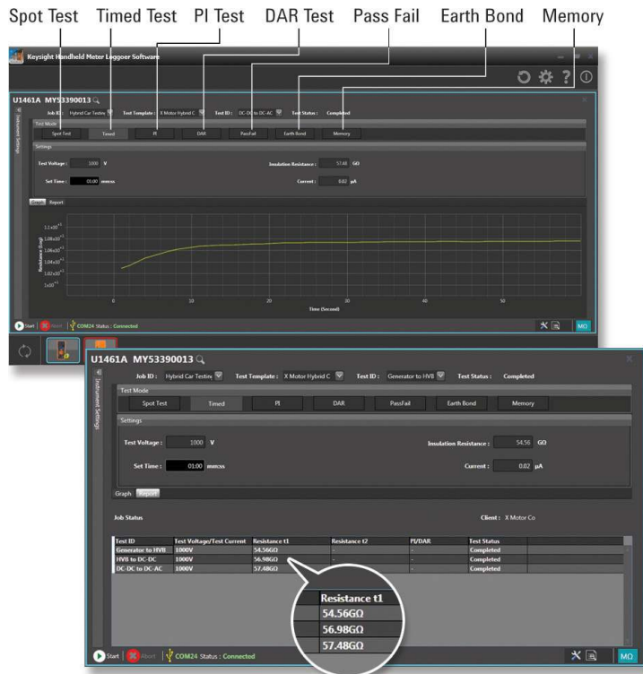
Job Status Reporting View

Eliminate the conventional data entering process and get error-free automated test reports generated in a tabulated or graphical form for easy interpretation and analysis – essential for troubleshooting, commissioning and preventive maintenance tasks. Better yet: All five insulation testers are compatible with the U1117A IR-to-Bluetooth ® adapter to enable wireless remote testing using Windows PC 1 or on iOS/Android smart devices. 2