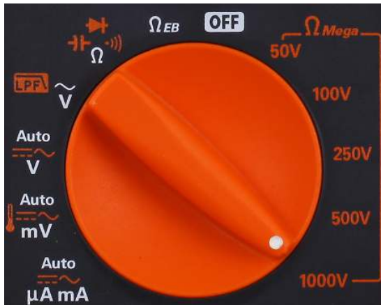
Figure 6. Insulation resistance tester with full featured DMM