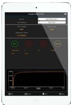
Figure 2. Perform remote testing with Keysight Insulation Tester Application