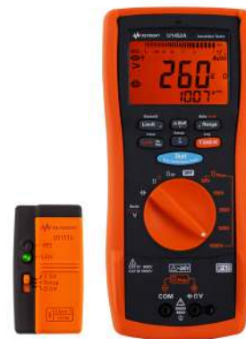
Figure 4. U1117A IR-to-Bluetooth Adapter enables wireless remote testings with the U1450A/U1460A series