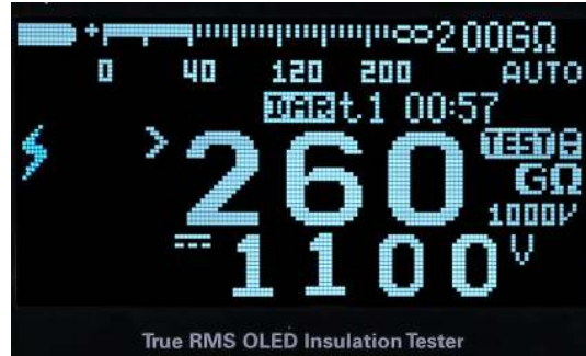
Figure 5. Adjustable insulation test voltage up to 1.1 kV

The adjustable insulation test voltage from 10 V to 1.1 kV in 1 V steps on selected two models 1 allows you to set precise test voltages catered to unique test application requirements. These typical applications are commercial avionics testing, military communications system testing and production line testing. The standard test voltages from 50 V to 1 kV is also available for selected models 2 .