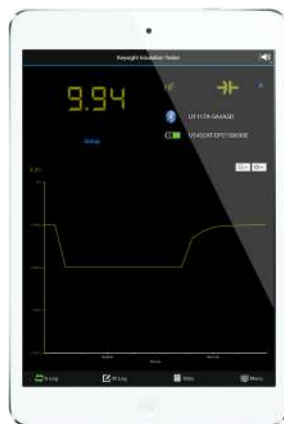
Figure 3. Data logging interface on Keysight Insulation Tester Application